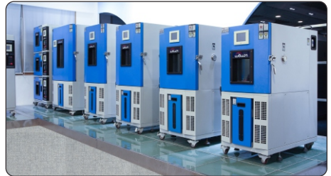
Scientific & Laboratory Equipment