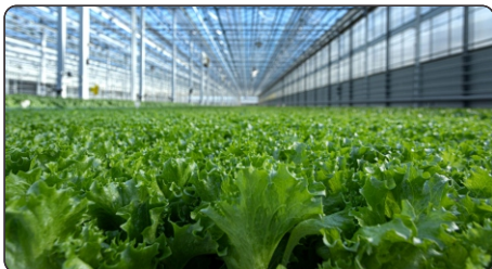
Green house / Hoop house